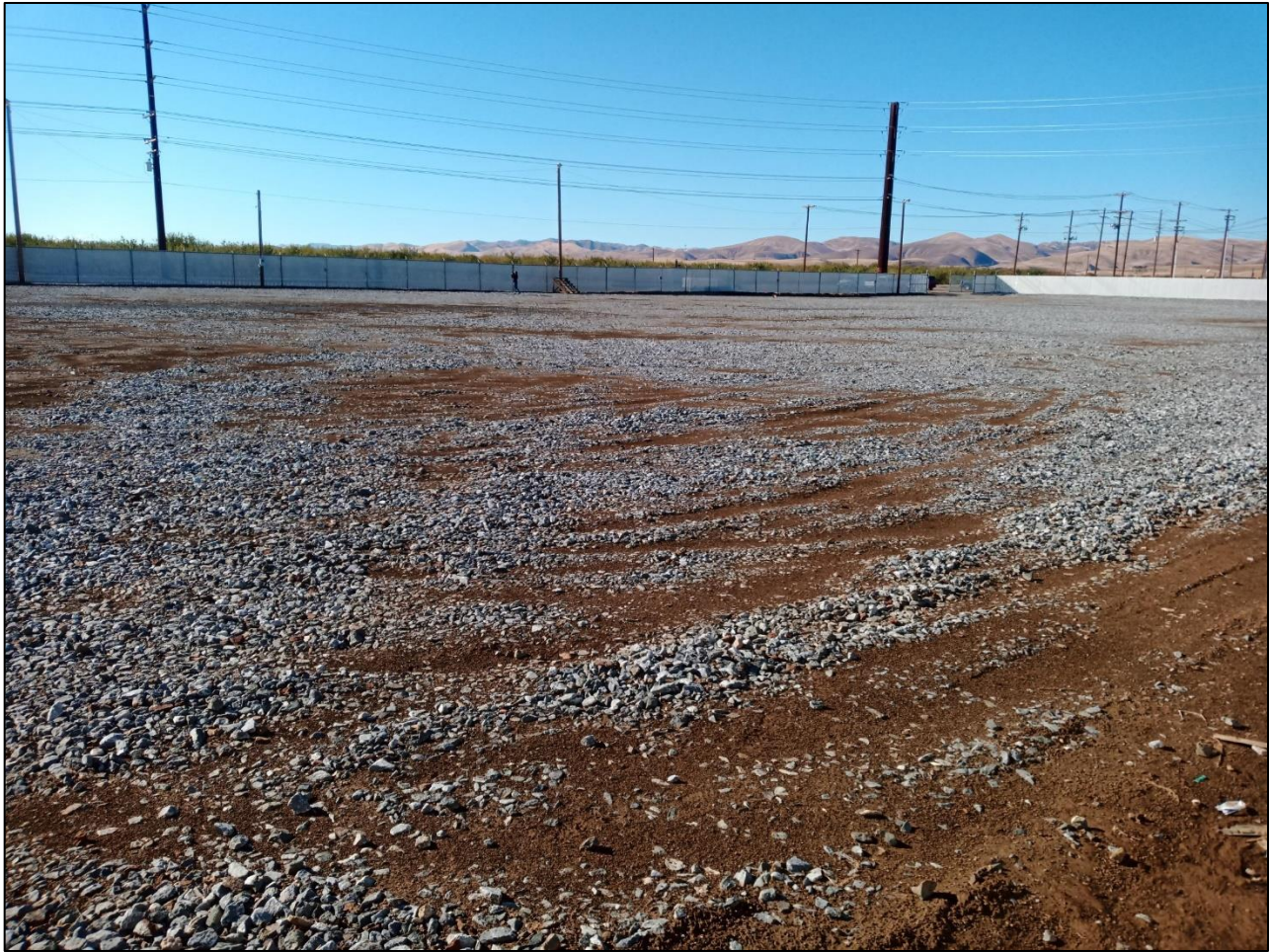
Figure 3. Overview of Proposed Generator Installation Area. View to the northeast.