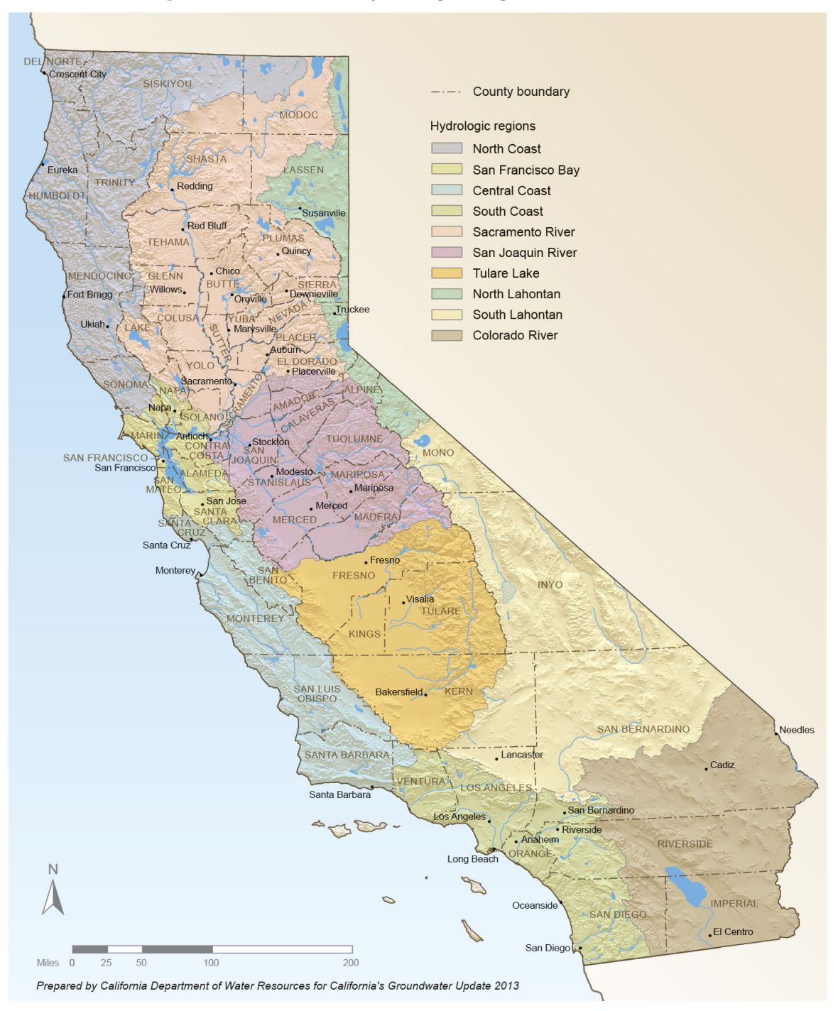
Figure C-2 California Hydrologic Regions and Counties